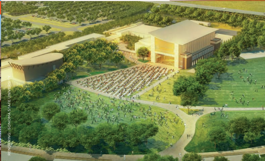
RENDERING: SONOMA STATE UNIVERSITY